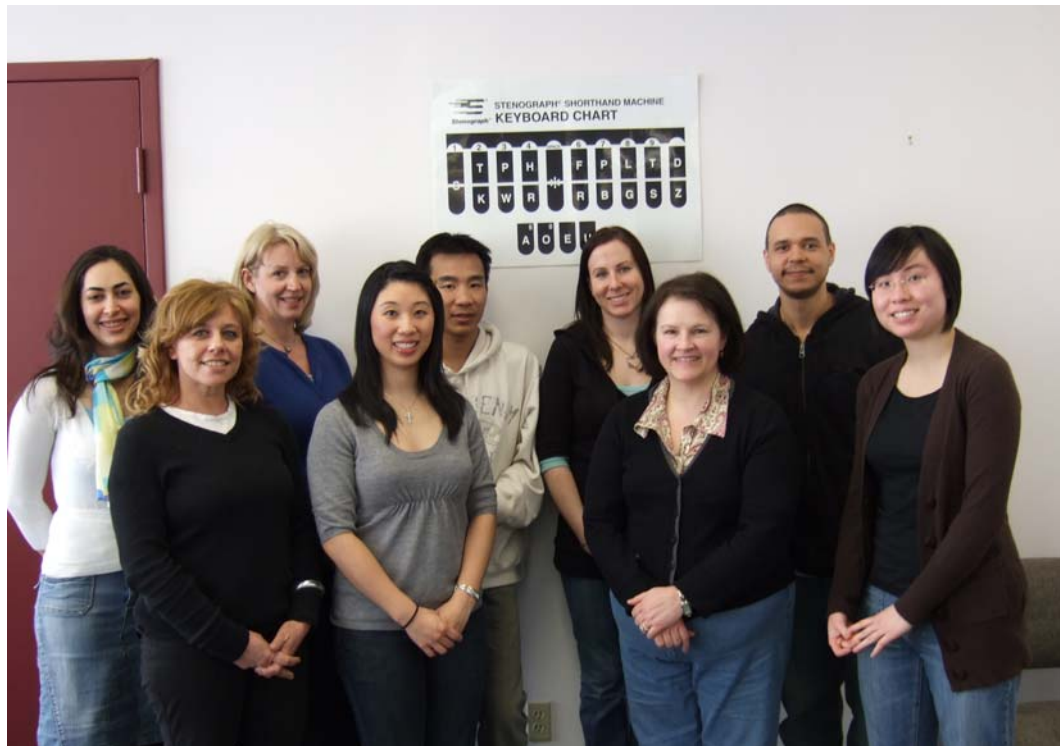
CCVS Students break from steno theory to get ready for academic learning